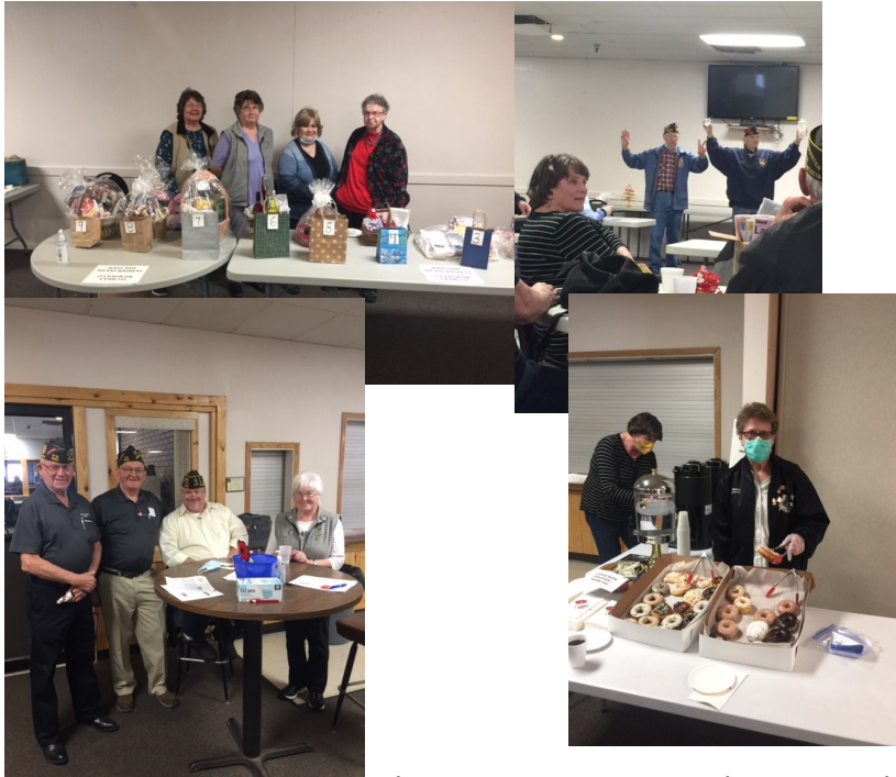
VFW Post 1260 hosted the 9th District VFW in Bemidji on March 6th. Even in the mist of COVID restrictions and protocols, the 9th District meeting was well attended.